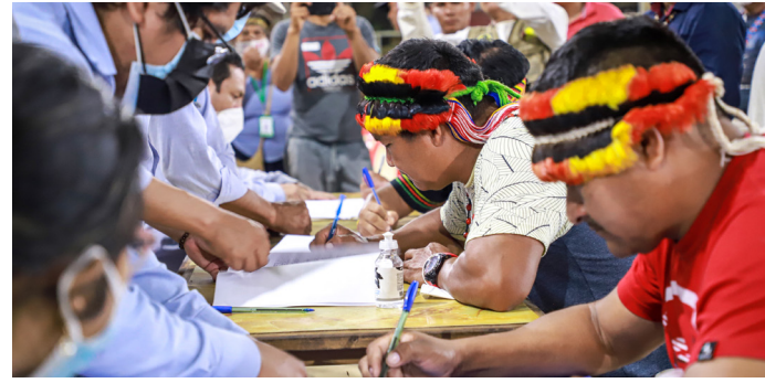
PERUPETRO S.A. and members of indigenous communities signing agreements