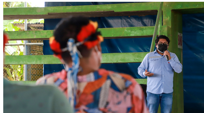
PERUPETRO S.A. staff presenting in front of members of native communities